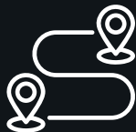
Team Journey Management