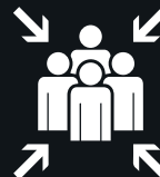
Emergency Response Management